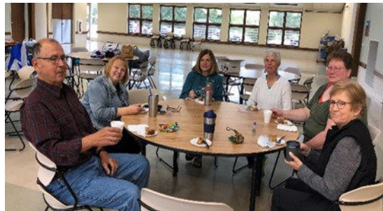
There's always time for a coffee break

The Mission of Healing in El Salvador 2022 is happening! We will be doing a modified event for 2 weeks in February entitled: Teach the Teachers. A small group from the US is joining a small team in El Salvador to work with health education leaders from 16 congregations to develop 4 community-based workshops (digestive, cardiovascular, respiratory and reproductive health). Each congregation team will receive all of the didactic materials, handouts, and healthcare items which they will need to repeat the 4 workshops during 2022 in their own communities. You can support this effort by donating: