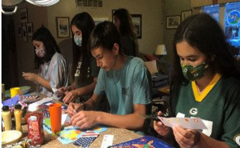
Buckley children preparing size labels

Thank you to everyone who donated girls' underwear for the Days for Girls project! We reached, and even exceeded, our goal of 400 pairs. We had a gathering of team members on October 14 and assembled 113 kits using the new method without plastic bags. We have more to assemble, so we'll meet again on November 18 in Olson Hall to try and complete another 100 kits.