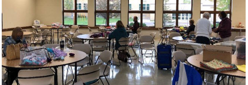
Hard at work in Olson Hall, a job for everyone!